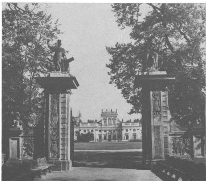
16. Wilanów. Main entrance to the Palace