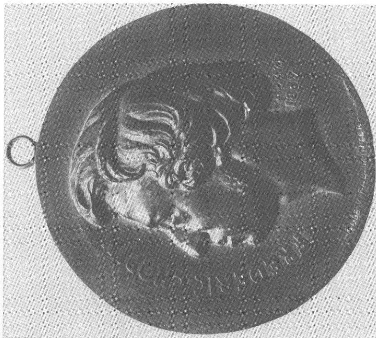
64. Portrait of Fryderyk Chopin. Medallion cast in Minter's manufactory according to the design of A. Bovy