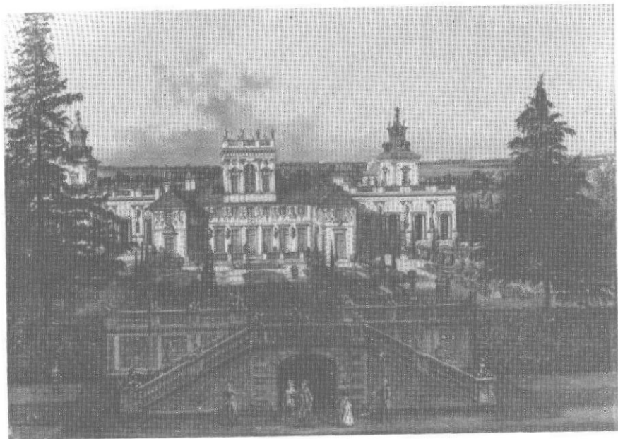
2. The Palace of Wilanów from the garden side. Painting by B. Bellotto Canaletto